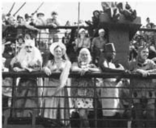
Figure 2. “Crossing the Line” Aboard a U.S. Navy Ship, March, 2000

European sailors were no strangers to sacrifice. When a ship crossed the Equatorial line, those sailors who had crossed before (known as “Shellbacks”) initiated those who had not (known as “Pollywogs”). The Shellbacks put on costumes and played the roles of characters such as King Neptune, his assistant Davy Jones, his consort (Amphitrite), the Barber, and various other characters. 3 In the British navy of the eighteenth century, initiates endured a series of duckings in the sea, also known as “baptism,” before paying Neptune’s fine (part of their allowance of grog). Such rituals of symbolic sacrifice, though varying according to nationality, size of the ship, and personalities of its constituent crew, continue to the present day (see Figure 2 below). It is the drama of the Beach played out at sea: Culture 1 is the Northern Hemisphere; the Southern Hemisphere is Culture 2. The requisite sacrifice takes the form of ritual cleansing of the victim, followed by the propitiation (or ransoming the victim by replacing him with inanimate valuables).